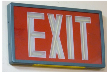
TRITIUM EXIT SIGN