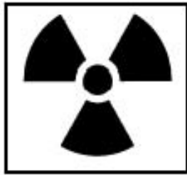
CAUTION RADIATION SYMBOL

Facilities and well sites required to monitor for radiation emitted from radioactive material must have appropriate monitoring equipment onsite (see Appendix D of this guidance for more information). Employees should be trained on the proper use of all fixed and portable equipment. Additionally, facility and well site operational staff should be trained to visually monitor waste during transfer or unloading for the potential presence of RAM. Specifically, they should be able to identify the “Caution Radiation” symbol (below) on containers and items that may not be detected by gamma monitors (e.g., tritium “EXIT” signs).